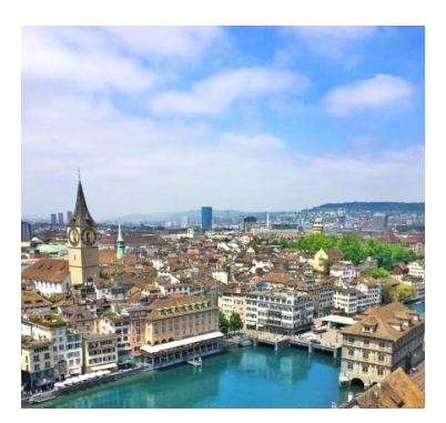
Zurich - The new registered legal seat for Globaladvocaten

To embrace the changes to the legal network, the group is also changing the legal structure.